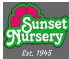
Sunset Nursery, Pembroke