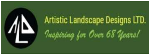
Artistic Landscape Designs LTD Ottawa